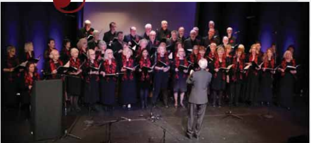
The People's College Choir performing on stage at Liberty Hall, 21 May 2024.