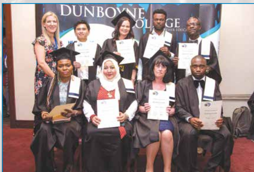
Healthcare students 2019