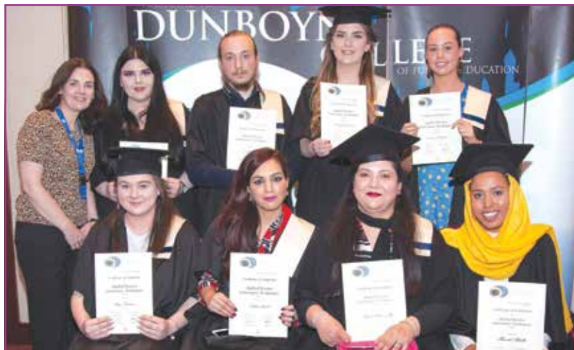
Pre-university Sports and Food Science students 2019