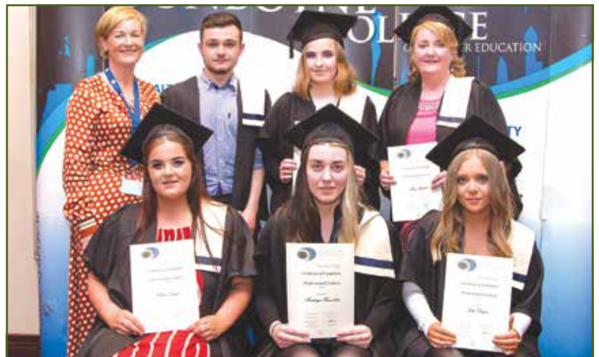
Professional Cookery students 2019