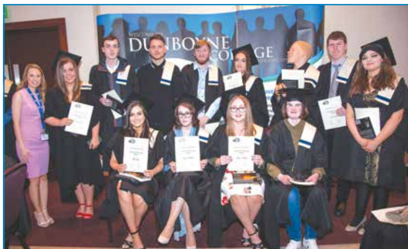
Pre-university Arts students 2019