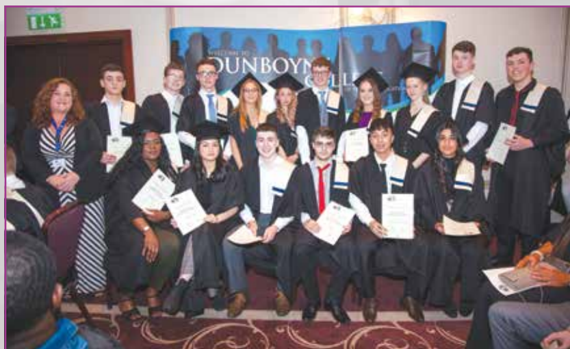
Pre-university Science students 2019