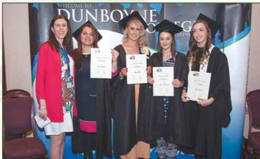
Art Portfolio students 2019