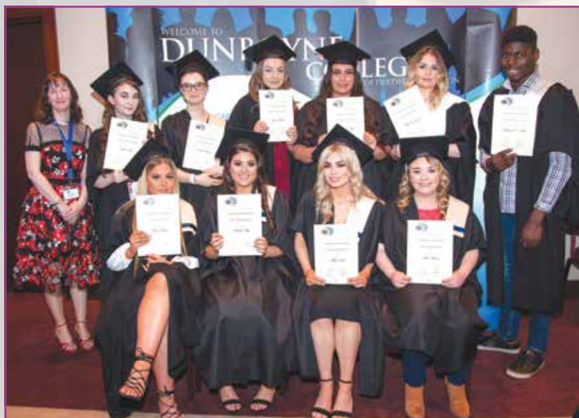
Pre-university Law students 2019