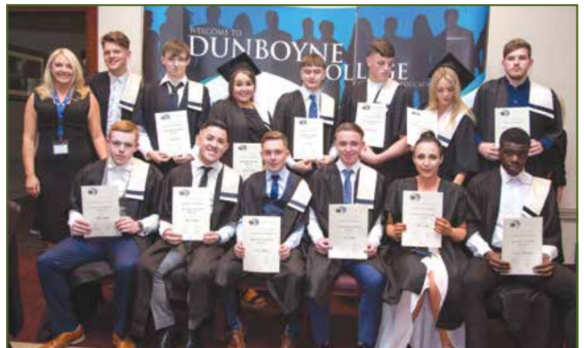
Sports Injury Prevention students 2019