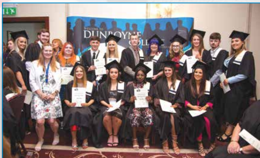
Social Studies students 2019