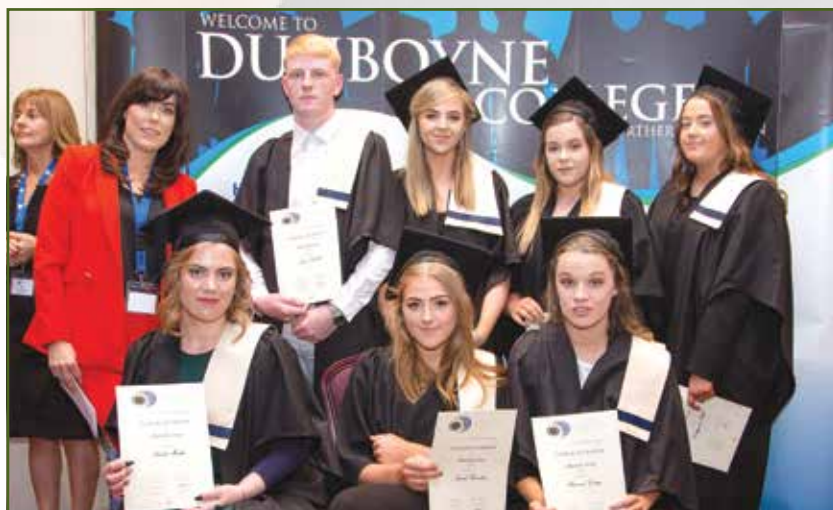
Hairdressing students 2019

Senior trade/ QQI Level 6 hairdressing option available