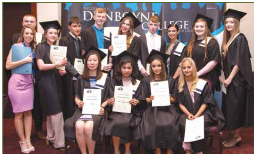
Tourism and Business students 2019