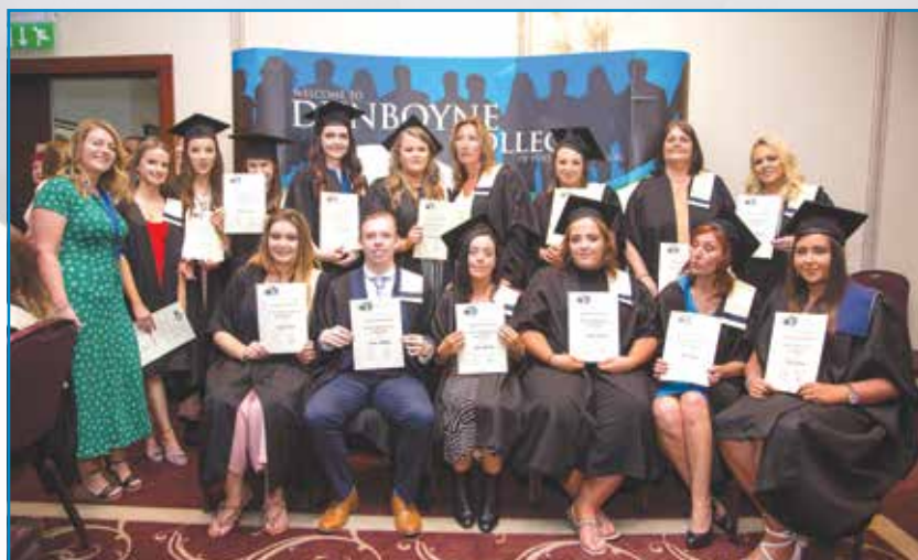
Childcare students 2019