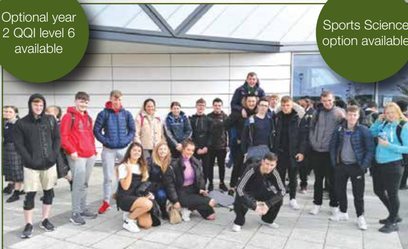
Sports Management students 2019