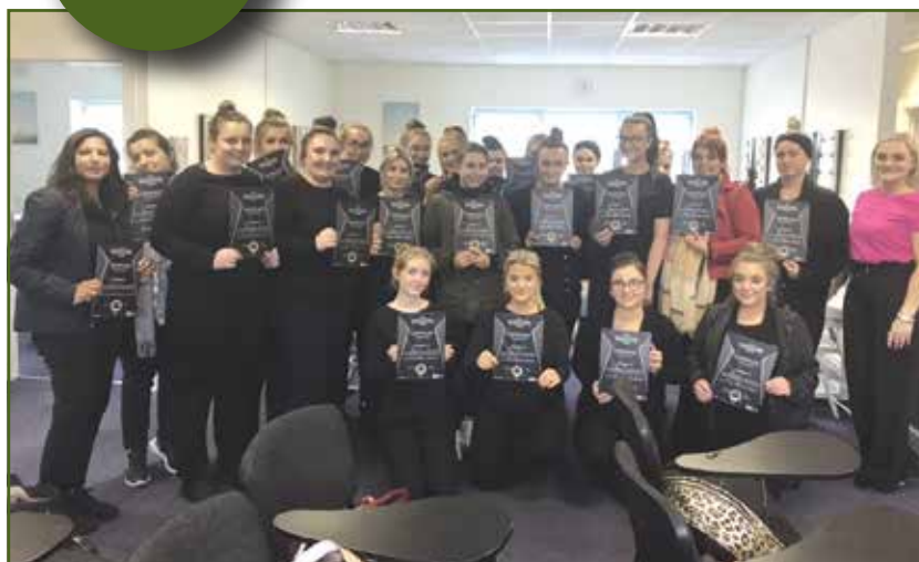
Beauty Therapy students 2019