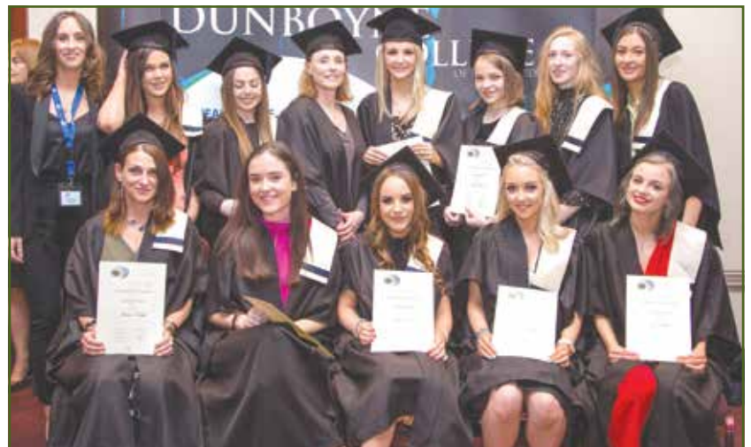
Animal Care students 2019