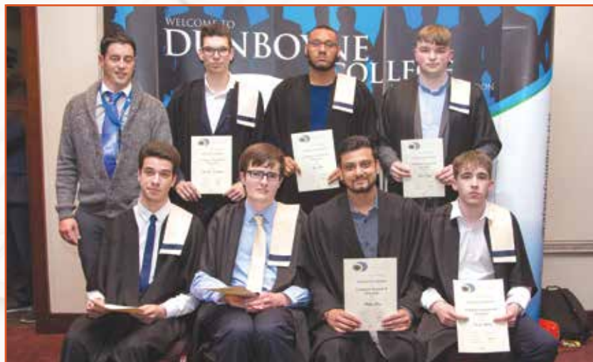
Computer Systems students 2019