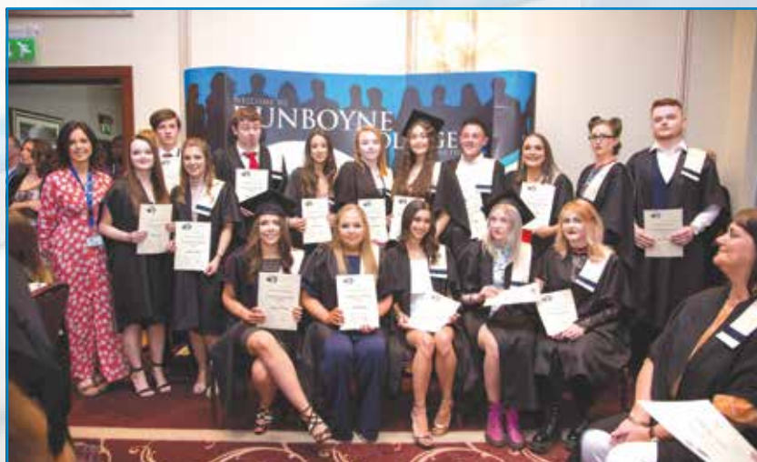
Applied Psychology students 2019