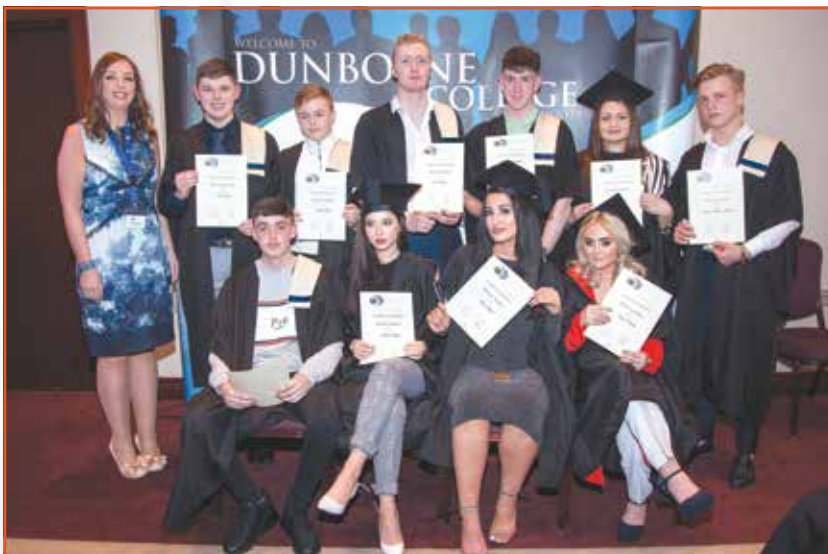
Pre-university Business students 2019