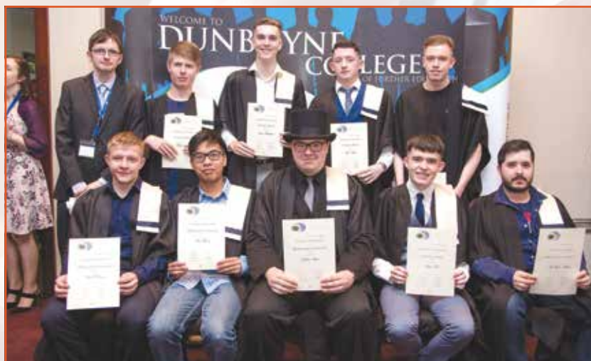
Creative Digital Media students 2019