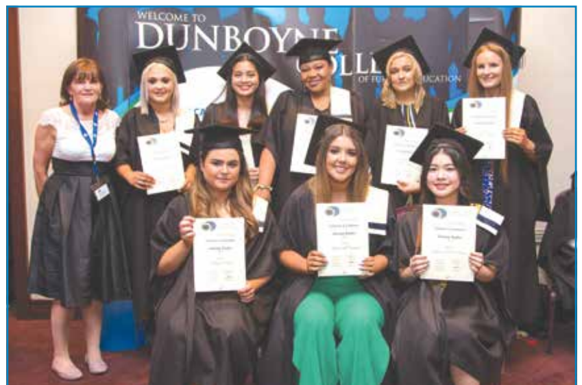
Nursing Studies students 2019