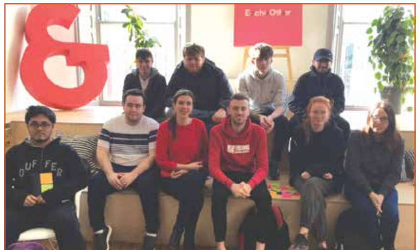
Graphic Design students 2019