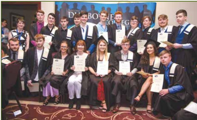
Music Performance students 2019