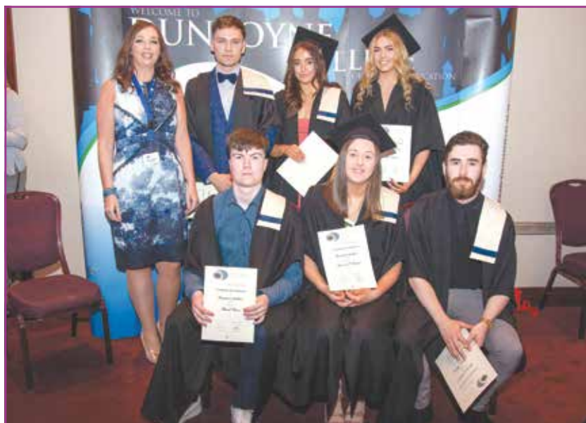
Business Law students 2019